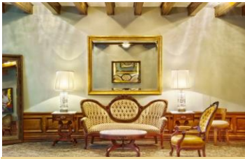
The Bridal/Hospitality Suite