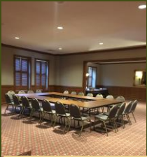
The Meeting Room