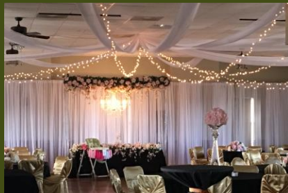
The Top of the Cactus

We would love to help you plan your celebration!