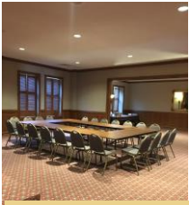
The Meeting Room