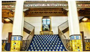
The Grand Staircase