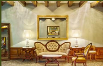
The Bridal/Hospitality Suite