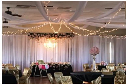
The Top of the Cactus