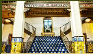
The Grand Staircase