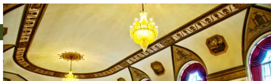
Mezzanine & Ballroom (Up to 250 guests)

We would love to help you plan your celebration!